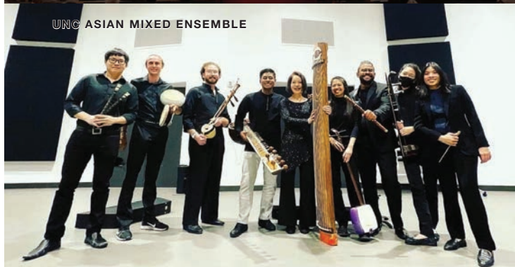
UNC ASIAN MIXED ENSEMBLE