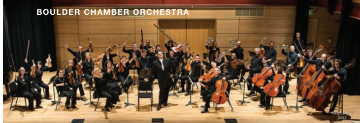
BOULDER CHAMBER ORCHESTRA