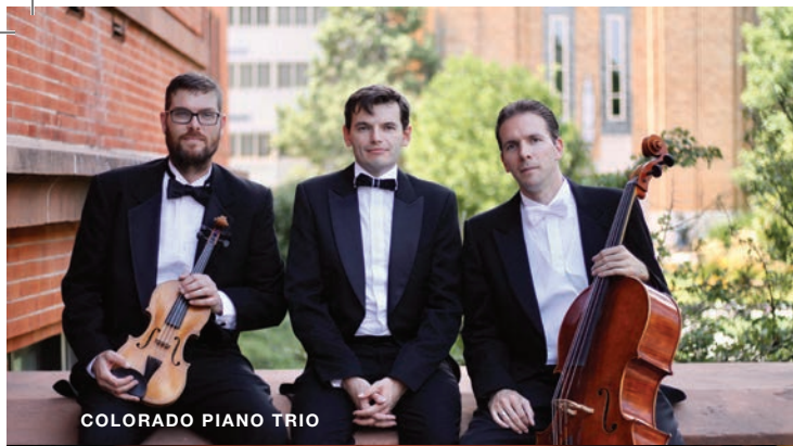
COLORADO PIANO TRIO