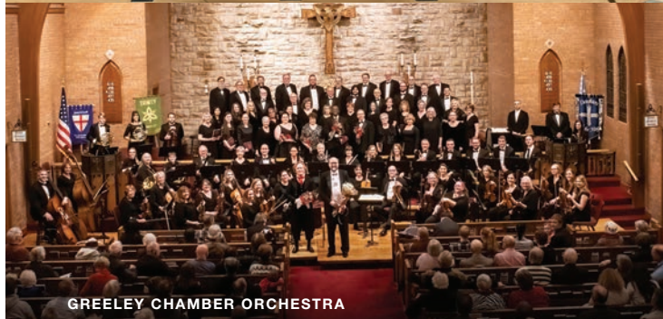
GREELEY CHAMBER ORCHESTRA